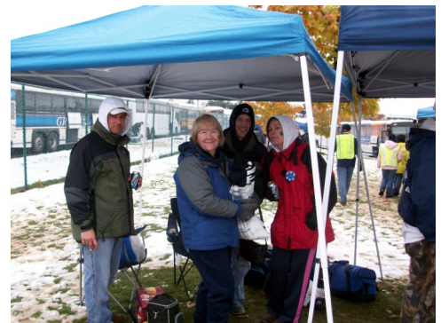
Chapter Members enjoy the snowy Homecoming game

Our chartered bus still went up to Happy Valley although with all parking on the grass fields closed and no tailgating, the Chapter Tailgate was cancelled. Thanks to all who donated their payments to the Scholarship fund.