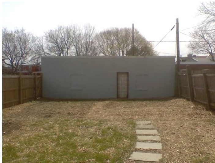
This summer, the Penn State Lancaster Club will help Tabor transform this backyard into a more scenic space.